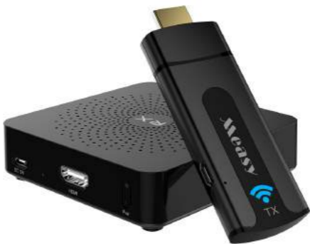
Model: W2H Mini (10m range)