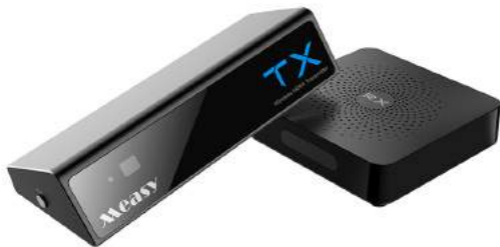
Model: W2H Max (30m range)