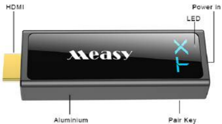
W2H Mini2 interface