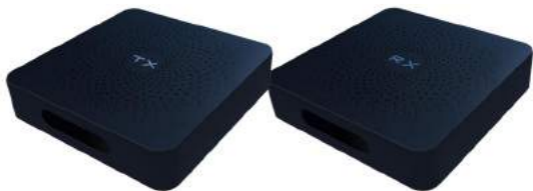
Model: W2H (30m range)