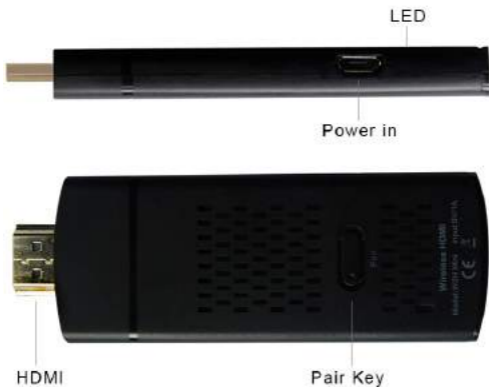
W2H Mini TX interface