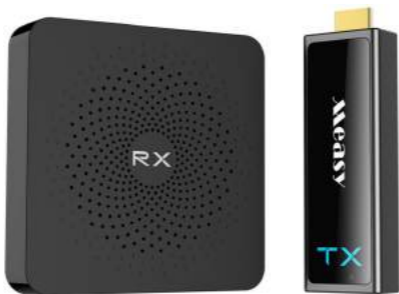
Model: W2H Mini2 (30m range)